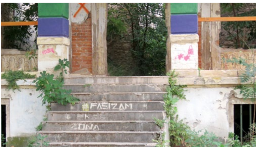
In the vicinity of the Partisan Cemetery, Mostar

systematically displaced, raped, killed. In Srebrenica alone, more than 8000 boys and men were killed. Dodik is denying the genocide to this day.