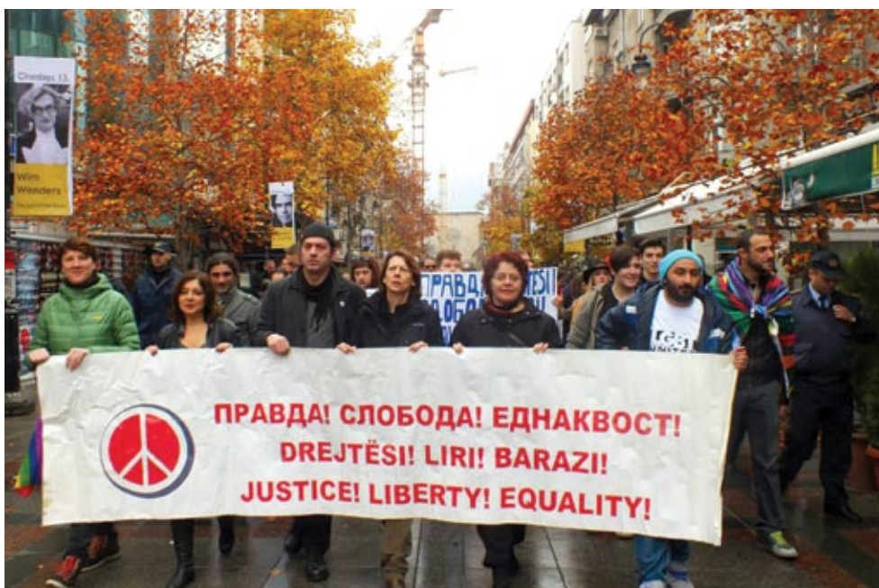
Skopje, March for Tolerance 2014 by CoalitionMargins, CC-BY 2.0

In fact, the first political parties, including those who claimed to represent collective ethnic rights, such as SDA (for Bosniaks), SDS (for Serbs), and HDZ (for Croats), framed themselves – especially during the election campaign of 1990, as belonging to the 'civic option', or as a civic alternative to Communism. At the time, civility, civil society, civic vocabulary, seemed to be the main language of political articulation, as some kind of 'password' for entering political arena. So, in the beginning, the very loose term of 'civic option' referred to all non-Communist or anti-Communist political agents willing to compete in the first multiparty elections in Bosnia and Herzegovina in November 1990. It was only after the elections that 'people's parties', having overwhelmingly won the elections, gradually shifted the paradigm of political articulation, revealing their ethnopolitical agenda. This rather short period of time between autumn 1988 and the outbreak of war in April 1992 could be considered the time of the beginning, and at the same time the defeat of 'civil society' and "its liberal-democratic and social-