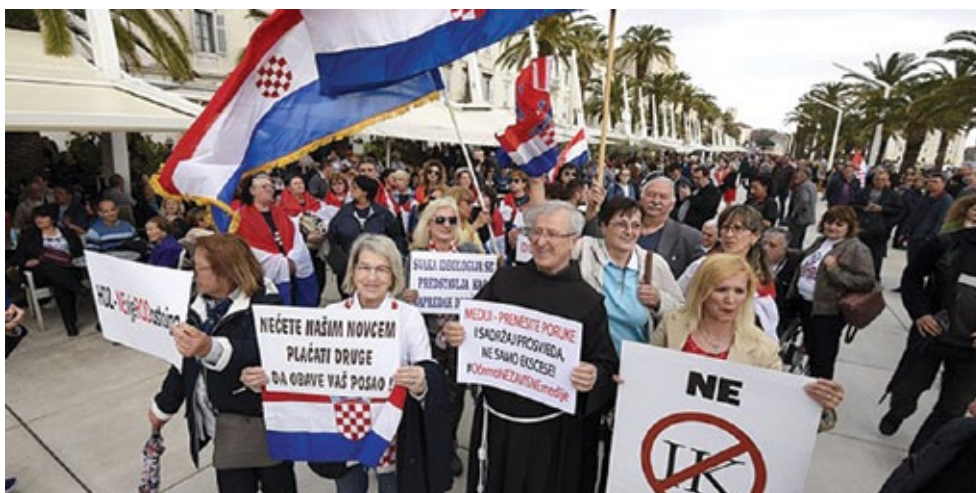
thousands of people at a protest march in Split by citizen's initiative 'Croatia against Istanbul Convention'

All of this lasted until the structure of the state was consolidated. This form of activities was then no longer needed for the development of a national project; the public/political work of the groups which carried it out was either terminated, or their activism took on a different form. Their status was put in hibernation so that they could