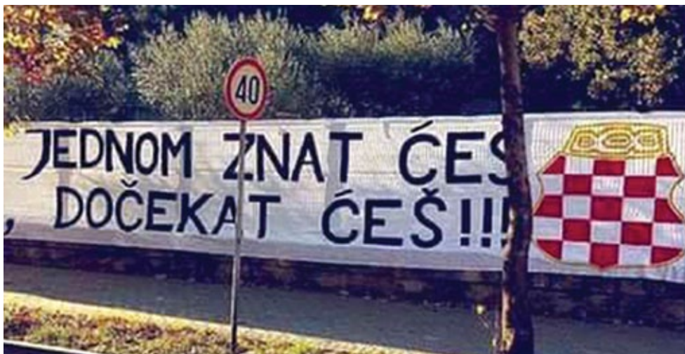
"Herceg-Bosna, your time will come"