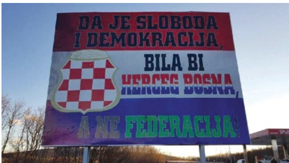
"If there were freedom and democracy, there would be Herzeg-Bosnia instead of the Federation", location unknown

In respect to the Hungarian-Croatian relations during the Habsburg era, the Croatian national identity-building canon portrays Hungarian politics exclusively as those of trying to subjugate Croatia under its own rule. Again, it is the truth, however, the more comprehensive picture of the Hungarian-Croatian relations that is missing. What is missing, or is not sufficiently underlined, is that Croatian politics from the late 18 th century onwards regularly opted for alliances with Hungary out of fear of Habsburg absolutism. In that respect, the 1868 Croatian-Hungarian Settlement subordinated Croatia to Hungary not only due to Hungarian political pressure, but also due to the contemporaneous Croatia's institutional incapacity to fully exercise financial, infrastructural and economic policies, as Josip Horvat nicely shows in his books. Moreover, the Hungarian 1848 national leader Lajos Kossuth has been portrayed as the most extreme Hungarian nationalist and thus