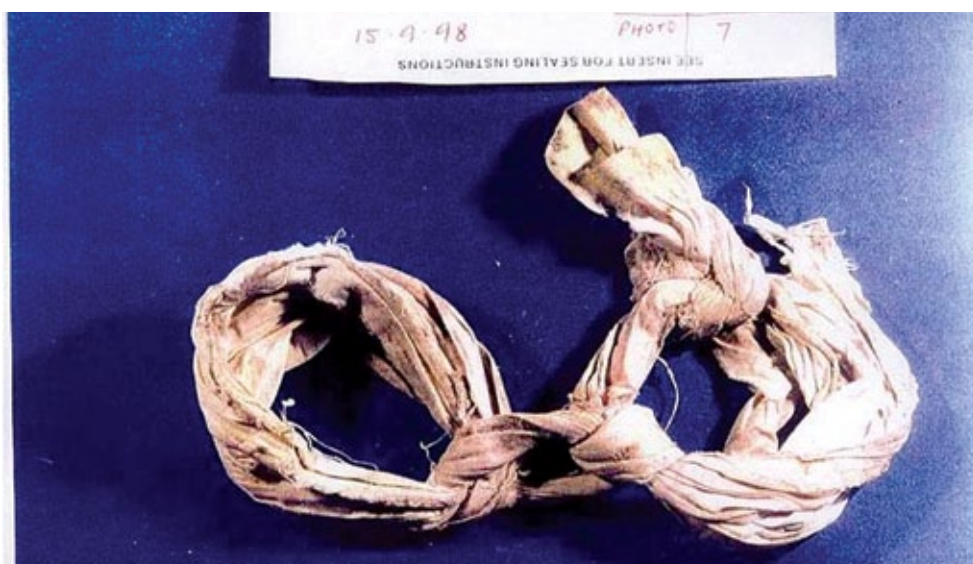
Ligature used to bind victims' hands in Srebrenica, Bosnia and Herzegovina, unearthed during an exhumation.

25-year existence 1 , the Hague tribunal has done a lot – for a start, it has convicted 90 persons out of the 161 that were charged. Among them were senior politicians of the region's states and entities, military and police officers, as well as some of the most brutal murderers from the bottom of the formal structures. More importantly, the Tribunal has collected extensive material on the wars of the nineties, on the basis of which it reached factual conclusions about the wartime events of the nineties.