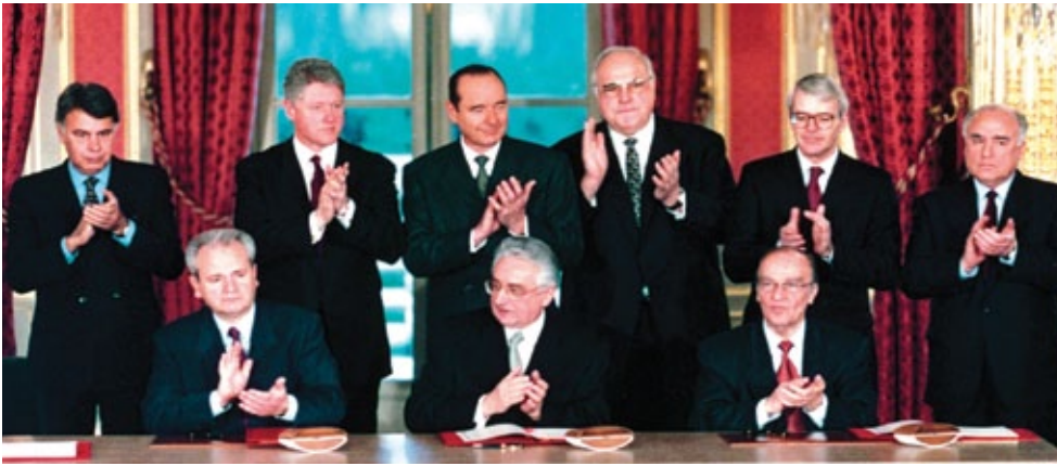
Signing of the Dayton Peace Agreement, "20 years since NATO's first major peacekeeping operation" by NATO North Atlantic Treaty Organization, CC-BY-NC-ND 2.0

espousing rights to Life, Liberty and the Pursuit of Happiness, and the French Declaration of Rights of 1789 championing liberté, égalité, fraternité were written with liberal values in mind.