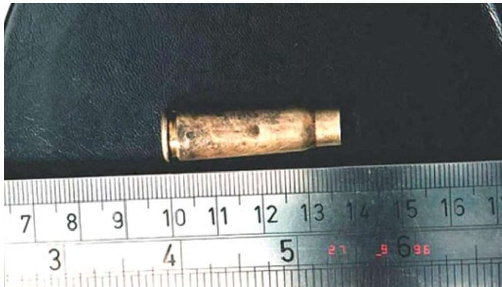
Bullet taken from the Luka detention facility near Brcko, Bosnia and Herzegovina.

WHO speaks about war crimes and the Hague trials? – We could divide the key speakers into three groups: a.) victims (mainly well-established individuals representing victims' organizations and associations; their statements are used mainly for the purpose of provoking emotional reactions in the public); b.) publicly recognized people (legal experts for example, but also other people who may attract attention, such as political analysts, who are often asked "how will this verdict influence inter-ethnic relations", or former Hague convicts, who may be asked questions like "how was life in the Hague") and c.) representatives of international organizations (who are used to delivering the message that, to a certain extent, the international community is a guarantee that events in the Hague will not jeopardize peace in the county). This shows how fragile is the consensus on Hague itself, as well as how superficial the media are in reporting on it, mainly focusing on the consequences of Hague verdicts.