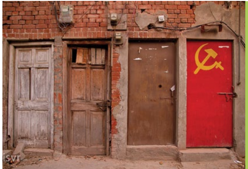
"Communism got colours"

Stressing the significance of Antifascism, which in the post-Yugoslavian phase first intensified in Croatia, especially disturbed the spirits in Serbia, where suddenly the Partisan liberation struggle became vital to identity: the Partisans were primarily Serbs, while others only took a marginal part in the struggle. Serb PLM members were acknowledged to an extent, but Tito remained completely obscured by intentional, and therefore mendacious forgetfulness. Under the influence of the monopolising of Antifascism within the European framework that was increasingly spreading from the Kremlin, Serbian nationalists wholly appropriated the Yugo-