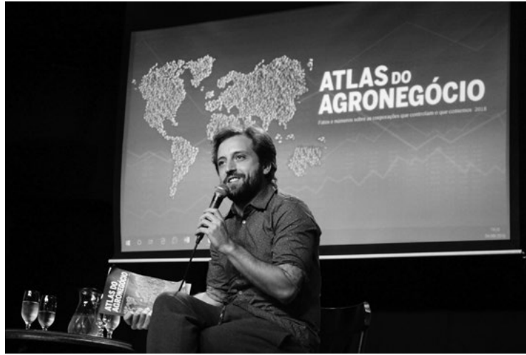
The Brazilian cabaret artist Gregorio Duvivier at the presentation of the Agrifood Atlas

and works with them to develop ideas for environmentally friendly coastal tourism. Time is running out, however: Major investment projects financed by other Asian countries are planned. Large hotels are to be built on the southern coast of the country to facilitate mass tourism. This development would have a lasting impact on the ecosystem, as it already has on the northern coast. The Marine Conservation Centre's efforts were rewarded with the National Geographic Marine Protection Prize – an accolade awarded to only three organizations worldwide.