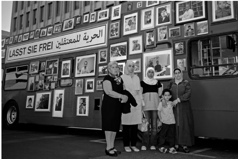
Families for Freedom activists call for international attention to the fate of their relatives imprisoned in Syria.

to fight against corruption and impunity. Our guests from Latin America emphasized that the special mechanisms enjoy strong support among the general public, which often sees them as their last hope. They also pointed out the successes that the mechanisms have achieved: for example, they have strengthened actors, institutions, victims and family members, while also gaining international and popular support. The participants called on the international community to raise the political price for all those who seek to question or undermine the legitimacy of the special mechanisms. They also stated that embassies should address the problems more explicitly in order to generate political pressure. Ultimately, the persistence of national and international actors is the most important prerequisite for ensuring sustained progress. The meeting was also attended by Iván Velásquez, Chairman of the International Commission against Impunity in Guatemala (CICIG), who was awarded the Alternative Nobel Prize in September together with Guatemala's former Attorney General, Thelma Aldana. Their successful fight against impunity and corruption thus garnered international recognition at a dramatic time of institutional crisis in Guatemala.