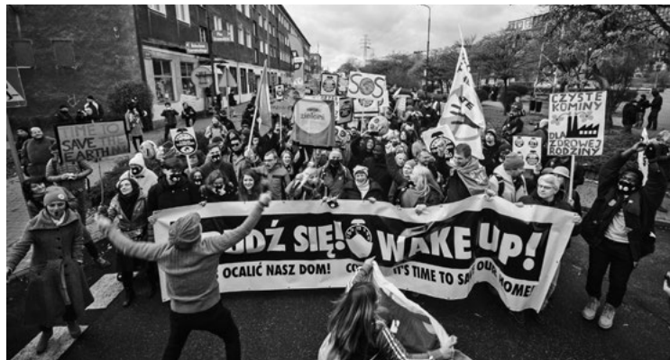
December 2018: Climate protection protest in Katowice on the occasion of the UN Climate Change Conference.

Extreme weather events such as heat waves, storms and torrential rainfall are on the increase. Climate change is real and its global consequences for humans and nature are already considerable. Nevertheless, governments remain virtually inactive – hardly any country is doing enough to achieve the Paris Agreement's target of limiting global warming to 1.5°C above pre-industrial levels. We consider this target to be achievable while upholding climate justice and democratic standards, and without deploying risky large-scale technologies such as geoengineering. We call for effective climate protection and adequate measures to adapt to climate change, as well as (gender-)equitable and effective climate finance. Furthermore, we need systemic change in the energy industry – away from centralized, large-scale utility companies and toward decentralized power generation. An energy system using 100 percent renewable energy is, for example, already technologically possible in Europe today – provided we tackle its transformation on a Europe-wide basis.