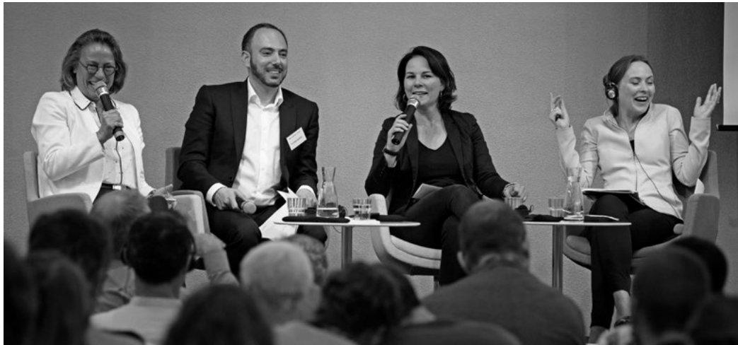
Panel of the European Conference (l. to r.): Sabine Thillaye, Sergey Lagodinsky, Annalena Baerbock and Katarzyna Pełczyńska-Nałęcz

Democratic states governed by the rule of law are under pressure worldwide. This includes the European Union and its member states. In Hungary and Poland, right-wing parties have embarked on a comprehensive transformation of the state that threatens the independence of the judiciary and the freedom of the media and civil society. Constitutional standards are being undermined in other EU countries as well. We are committed to a democratic and open Europe and support civil society, especially in places where its scope for action is narrowing.