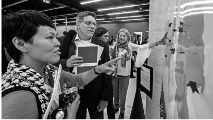
Berlin, November 2018: conclusion of our three-year “Welcoming Communities Transatlantic Exchange” project. The exchange concluded with the formulation of recommendations for action for people involved in integration work in cities and towns in Germany and the United States.

protection. In December 2018, our Rabat office hosted a two-day conference in Marrakech on the opportunities and risks of European-African migration cooperation. The panel discussions, film screenings and interactive plays looked at questions like: How can human rights-based approaches be given a greater role in international cooperation on migration policy? How can legal channels for migration between Europe and Africa be expanded? How can intra-African formats of cooperation be promoted? Civil society actors working on migration on both sides of the Mediterranean had the opportunity to exchange views and establish contacts and will – as we hope – advance the political discourse in Morocco and Europe.