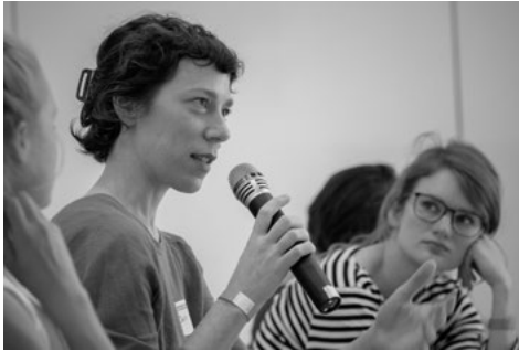
Building a feminist internet: workshop sessions

In a democratic society, no one should be persecuted for their sexual orientation and identity. Yet that is the order of the day in many countries. Together with our partner organizations, we are working to bring about change. Our most important objective is to strengthen women's rights and to promote legislative initiatives to protect the human rights of lesbian, gay, bisexual, trans* and inter* people (LGBTI) worldwide.