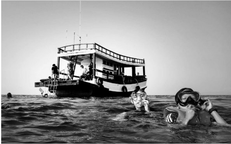
Cambodia: Our partner organization, the Marine Conservation Centre, fights illegal fishing and promotes the protection of endangered coral reefs and marine life.

voice their concerns about the risks of the technology. They asked the IACHR to ensure that human rights are respected and environmental damage avoided in countries where fracking takes place. The activists also stressed the importance of providing the public with adequate information. The Commission was impressed and promised to carefully review the testimony with a view to potential rulings. In Colombia, the country's new president, Iván Duque, announced that restraint would be exercised in fracking. In addition, Mexico's recently elected president, Andrés Manuel López Obrador, has even promised to refrain altogether. However, since both countries base their growth model on fossil fuels, a watchful eye will be needed here. The Argentinian economy is heavily dependent on foreign exchange income from the sale of shale gas, so an expansion here is very likely. Nearly half of Latin America's 2,700 active fracking wells are located in Argentina.