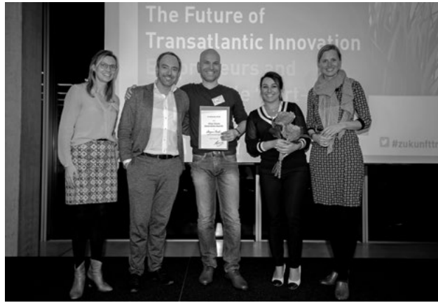
Zukunft Transatlantica: A Danish team of entrepreneurs won the pitching contest

oriented mobility. The series included visits to Berlin and Stuttgart as well as a German-Czech conference on the future of sustainable urban mobility that was held in September 2018 as part of European Mobility Week. The conference was organized in cooperation with the Prague Institute of Planning and Development (IPR Praha) and the Czech Centre for Transport and Energy (CDE). In late 2018, our office published “Restless Cities”, in which authors from the Czech Republic, Slovakia and Hungary report on their experiences and best-practice examples of sustainable urban development.