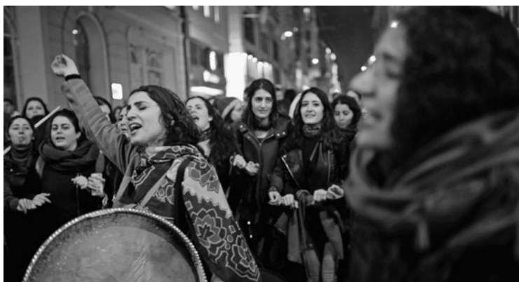
March 2018: On International Women's Day, Istanbul's women's movement traditionally gathers for a feminist night stroll.

Human rights are coming under increasing pressure all over the world. Autocratically governed states flout civil rights and antagonize critical civil society groups, persecuting and criminalizing them to stifle protest from the outset. Freedom of the press and an independent judiciary are also in danger, or have already been abolished in many places. Promoting democracy, the rule of law and political participation is part of our core mission – in Germany and worldwide. Authoritarian governments are in power in many of the countries in which we work. Our offices increasingly have to support partners who are politically persecuted or have to leave their countries. Together with our partner organizations, we are committed to ensuring that all people know their rights and are able to demand and defend them.