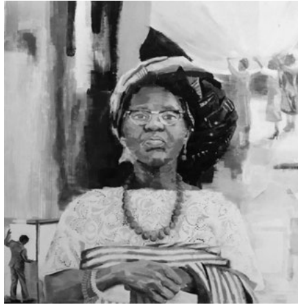
A larger-than-life portrait of Nigerian feminist Funmilayo Ransome-Kuti on the outside wall of our Senegal

Art can be a driver of social change, a means of resistance and an integral part of social and political movements. Art sharpens perception, trains intuition and inspires creative action. We therefore promote art and culture as expressions of social self-understanding.