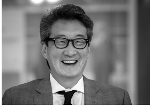
Berlin, Aupo 2018: Victor Cha