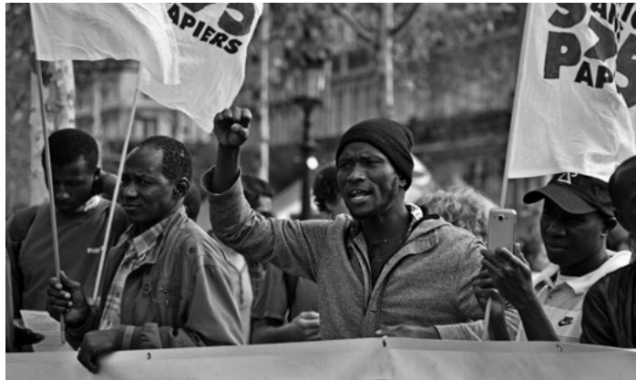
Paris, October 2018: Demonstration for the Aquarius sea rescue ship and civilian sea rescue

There are many reasons for flight and migration: persecution and war, poverty and hunger, but also the pursuit of a better life. Migration is – in short – the medium or long-term relocation of the focal point of one's life. This is happening in large numbers within the law but also outside it, and its effects are increasingly felt in Europe. Under the Geneva Convention, countries are obliged to receive refugees and offer them protection. In contrast, managing migration and developing an immigration policy is a political task that individual governments can choose to address or neglect.