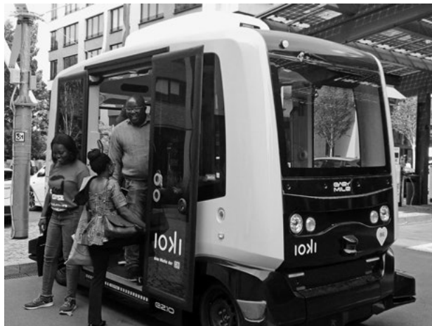
Nigerian visitors in an autonomous minibus on the EUREF Campus in Berlin

Climate protection will not succeed without a transformation of transport sectors. We want to eliminate the bottlenecks in transport policy and show how mobility of the future can work. We support green transport strategies for people-oriented and sustainable urban development at home and abroad. Strategies must include citizen participation in order to improve the quality of life and environment in cities and to ensure affordable housing for all.