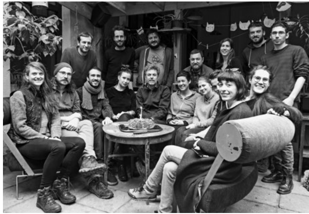
Members of the MOBA Housing Network – a platform for the development of cooperative housing projects in southeastern Europe.

more and more people are joining forces because they want to do business differently, with an economy based on principles such as self-organization, responsibility for the community and mutual cooperation. Throughout the country and in almost all sectors – from the production and marketing of organic food to IT services – new initiatives and cooperatives are being founded every year despite challenging conditions. Our Thessaloniki office has supported the movement from the very beginning. Training courses were particularly important in this regard – in order to help people with workable business models establish companies, network with one another and articulate their interests more forcefully to policymakers. Their many experiences will now be presented in a systematic manner on www.kalamathe.gr , an online education platform that is growing steadily and features easy-to-understand texts and videos on a range of topics. Its board of trustees is still being set up, and its organization will be modeled after public welfare enterprises.