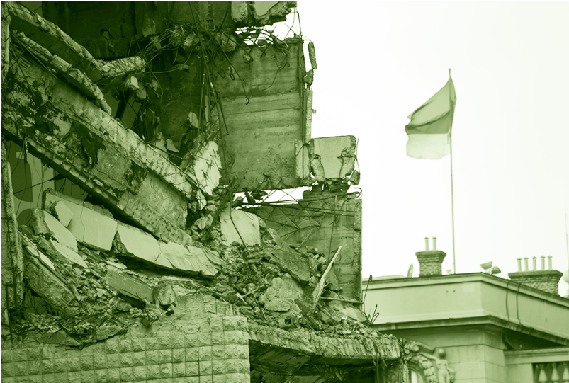
Joint Chiefs of Staff Headquarters in Belgrade, in ruins since the 1999 NATO military campaign, pictured in 2019.

or permission from the state with a heavy fine or imprisonment. 17