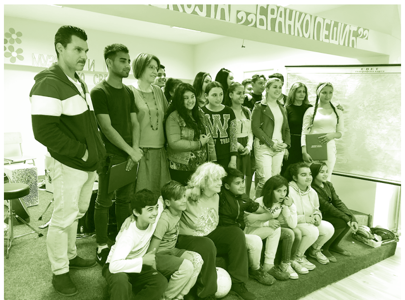
Pupils with their teachers at a school event.

Fleeing from the Kosovo war, Roma families tried to seek asylum in countries such as Ger-