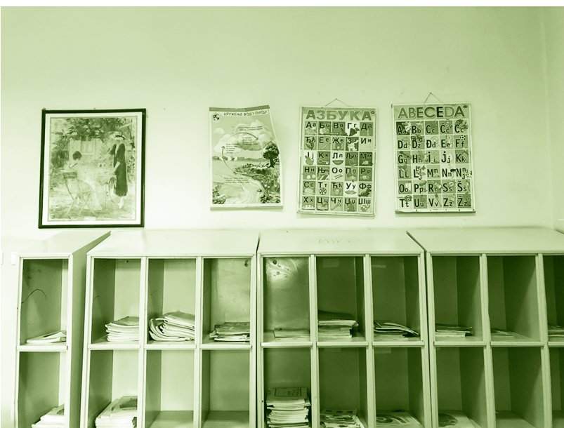
A classroom at the “Branko Pešić” school.

Although Roma families know that asylum applications will almost certainly be rejected, they still decide to take this step, pushed by poverty to find a better life for at least a few months.