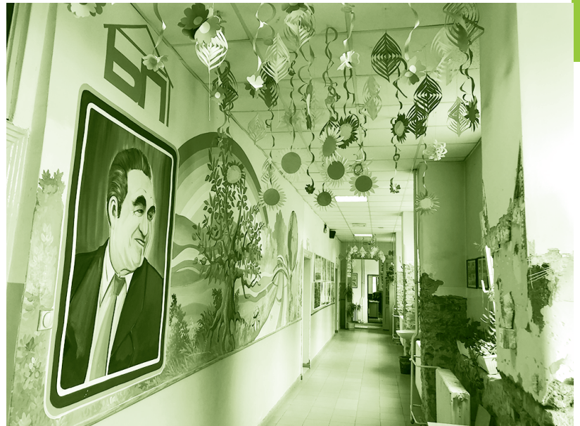
School hallway decorated for the School Day celebration.

Due to all the problems that pupils face on a daily basis, the school uses a modified teaching model with a reduced curriculum that is adapted for children with limited prior knowledge, poor knowledge of the Serbian language and very difficult living condi-