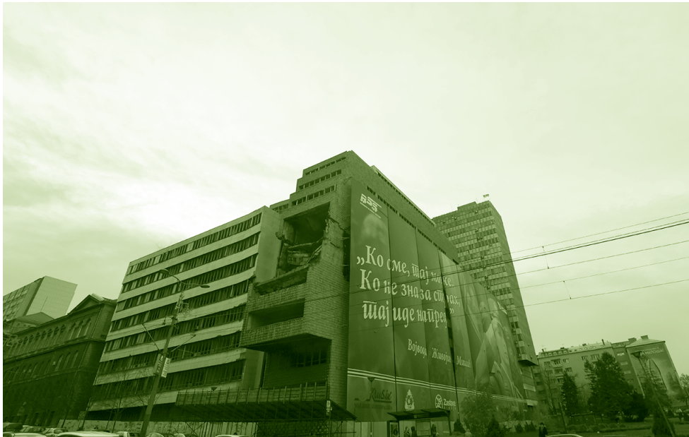
Joint Chiefs of Staff Headquarters in Belgrade, in ruins since the 1999 NATO military campaign, pictured in 2019.

closed down. Albanian employees in public enterprises are laid off en masse , including school teachers. Students are unable to attend classes taught in the Albanian language. A number of professors at the University of Pristina are dismissed. An informal school system then develops in Kosovo, and classes are held in private homes. Kosovo Albanians boycott the elections for the National Assembly of Serbia in 1992, instead holding their own. Thus, a “parallel system” is created, with a shadow government that provides services to Kosovo Albanians. A declaration on the rights of national minorities adopted by the Serbian Assembly in 1992 lays the blame for the human rights situation on the Albanians.