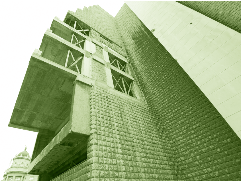
Joint Chiefs of Staff Headquarters in Belgrade, in ruins since the 1999 NATO military campaign, pictured in 2019.

and Hashim Thaçi - Ed.), with the consent or passive agreement of certain international mediators.