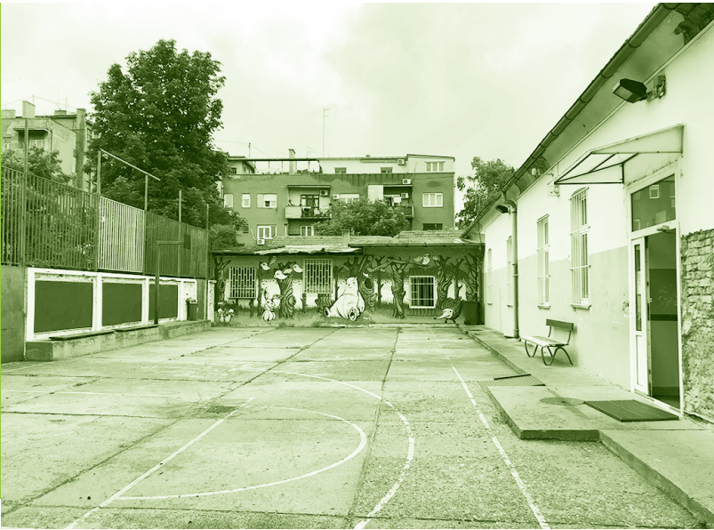
School area in Zemun, Belgrade.

many, France and Austria. However, many of them have returned to Serbia since then. Over 22,000 people have been transported back to Serbia since 2007 in accordance with the EU Readmission Agreement, according to data from the Commissariat for Refugees and Migration of the Republic of Serbia. Some were deported and some decided to return on a so-called “voluntary” basis. Roma families with children make up the largest proportion of the returnees, having spent from several months to several years in European countries, most commonly in Germany.