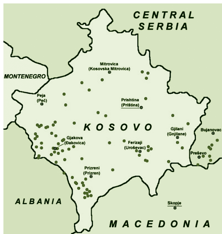
Figure 1. Sites identified as being targeted by ordnance containing depleted uranium

According to available information, depleted uranium ammunition was used in at least 112 cases across Kosovo, mostly in the southwestern regions of Gjakova, Prizren and around Ferizaj. Additionally, depleted uranium was also used less intensively in attacks by U.S. bombers in the areas of Vranje, Preševo, and Bujanovac, as well as in a locality in Montenegro 1 . Although some estimates are much larger, information available from NATO confirms that 10 tons of depleted uranium am-