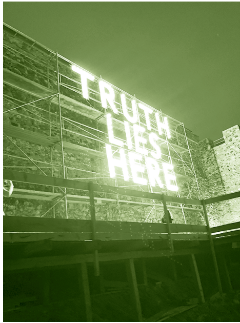
Prizren, summer 2019.

Through increased dialogue we can create better ways of dealing with the past, challenging nationalist propaganda and increasing social resilience, so that past conflicts are never repeated. We believe that it